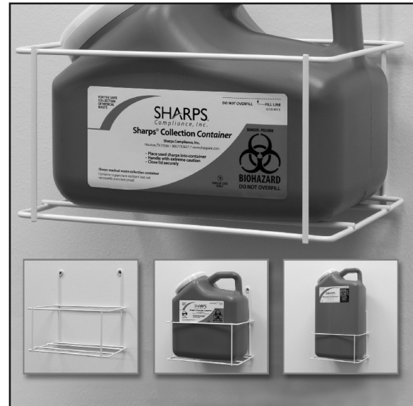
Model #50014: For use with 1-Gallon, 2-gallon and 3-gallon Sharps Collection Containers.