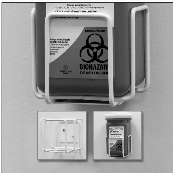
Model #50006: For use with 1-Quart Sharps Collection Container only.