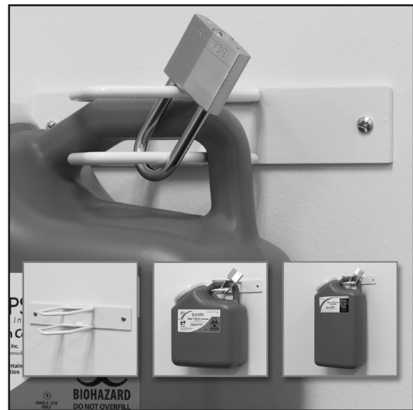
Model #50005: For use with 1-Gallon, 2-gallon and 3-gallon Sharps Collection Containers.