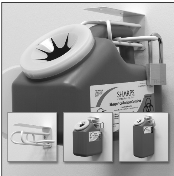
Model #50004: For use with 1-gallon, 2-gallon and 3-gallon Sharps Collection Containers.