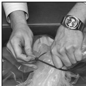
Fig. 6: When ready for shipping, securely seal bag around the containers using tiewrap.