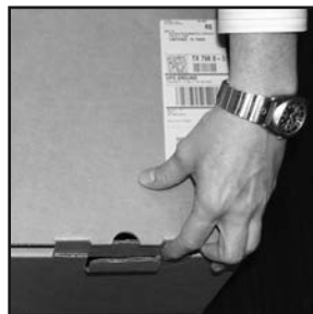
Fig. 7: Close numbered shipping box flaps in order. Ship-to label must be showing.