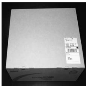
Fig. 10: Give box to UPS. NO ADDITIONAL FREIGHT IS NECESSARY.