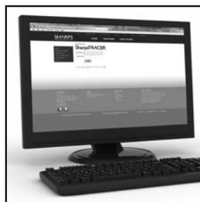
Fig. 11: For tracking purposes, log on to your SharpsTracer® account at www.sharpsinc.com . Enter Tracking Form number. Download proof of recovery in 30-45 days.