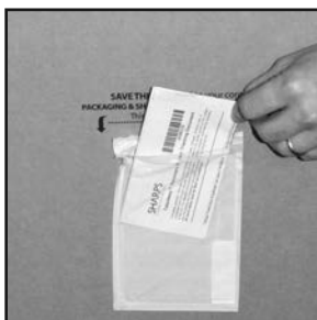
Fig. 9: Remove Tracking Form from plastic pouch on shipping box. Complete top section. YOU MUST SIGN THE FORM. Remove bottom copy and keep. Place remaining copies back in pouch with barcode facing out. Box will not be accepted without tracking form.