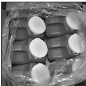
Fig. 5: Only ship shipping box when all sharps containers with which the shipping box came are enclosed.