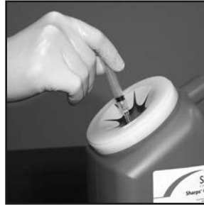
Fig. 3: Place needles, syringes, lancets, other sharps and used healthcare materials into containers. DO NOT OVERFILL.