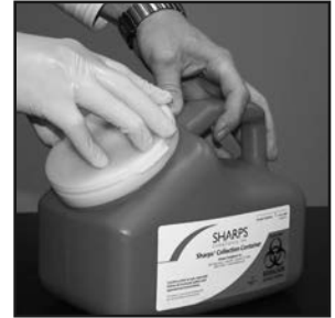
Fig. 4: Close lid by snapping firmly over opening. Make sure lid is tightly sealed prior to packaging.