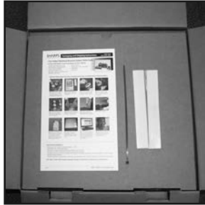
Fig. 2: Save the shipping box and all components for repackaging the containers for return shipping.