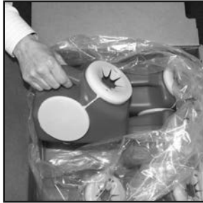
Fig. 1: Remove each container from packaging as needed and place at point of use. DO NOT REMOVE ABSORBENT PADS.